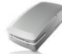
C061 CONTROL BOX Easy to fit, easy to clean, Worldwide compatible and with OpenBus technology