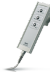
HL70 HAND CONTROL Ergonomic design and switch activations. Lockable handset