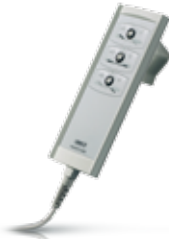
HL70 HAND CONTROL Ergonomic design and switch activations. Lockable handset