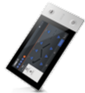
ACT TOUCH CONTROL The future of full bed control with intuitive touch-screen user-interface