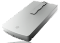
BA21* LI-ION BATTERY

Easy to fit, easy to clean, Worldwide compatible and with OpenBus technology