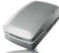
CA40 CONTROL BOX Can be fully integrated with LA40