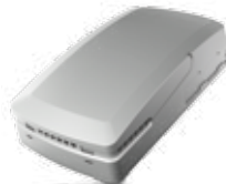
CO61 CONTROL BOX Easy to fit, easy to clean, Worldwide compatible and with OpenBus technology