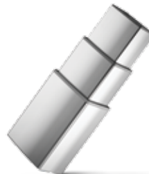
BL1 COLUMN Up to 2,000 N Lifting column. Optional cables inside the column