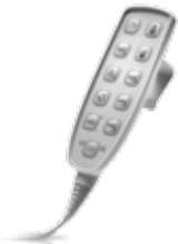
HD80 HAND CONTROL Ergonomic design and switch activations. Magnet or hook