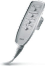
HL80 HAND CONTROL

Ergonomic design and switch activations. Lockable handset