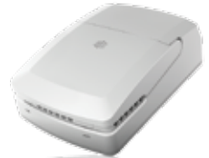
BA19 LEAD ACID BATTERY Compact size, easy to clean, easy to remove