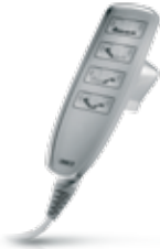
HB80 HAND CONTROL Ergonomic design and switch activations. Magnet or hook